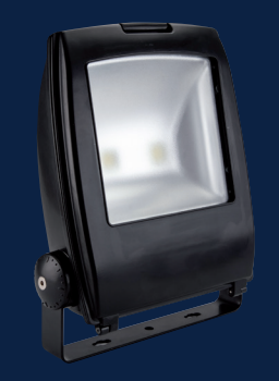
MARINER -High integrity, coastal protected LED floodlight